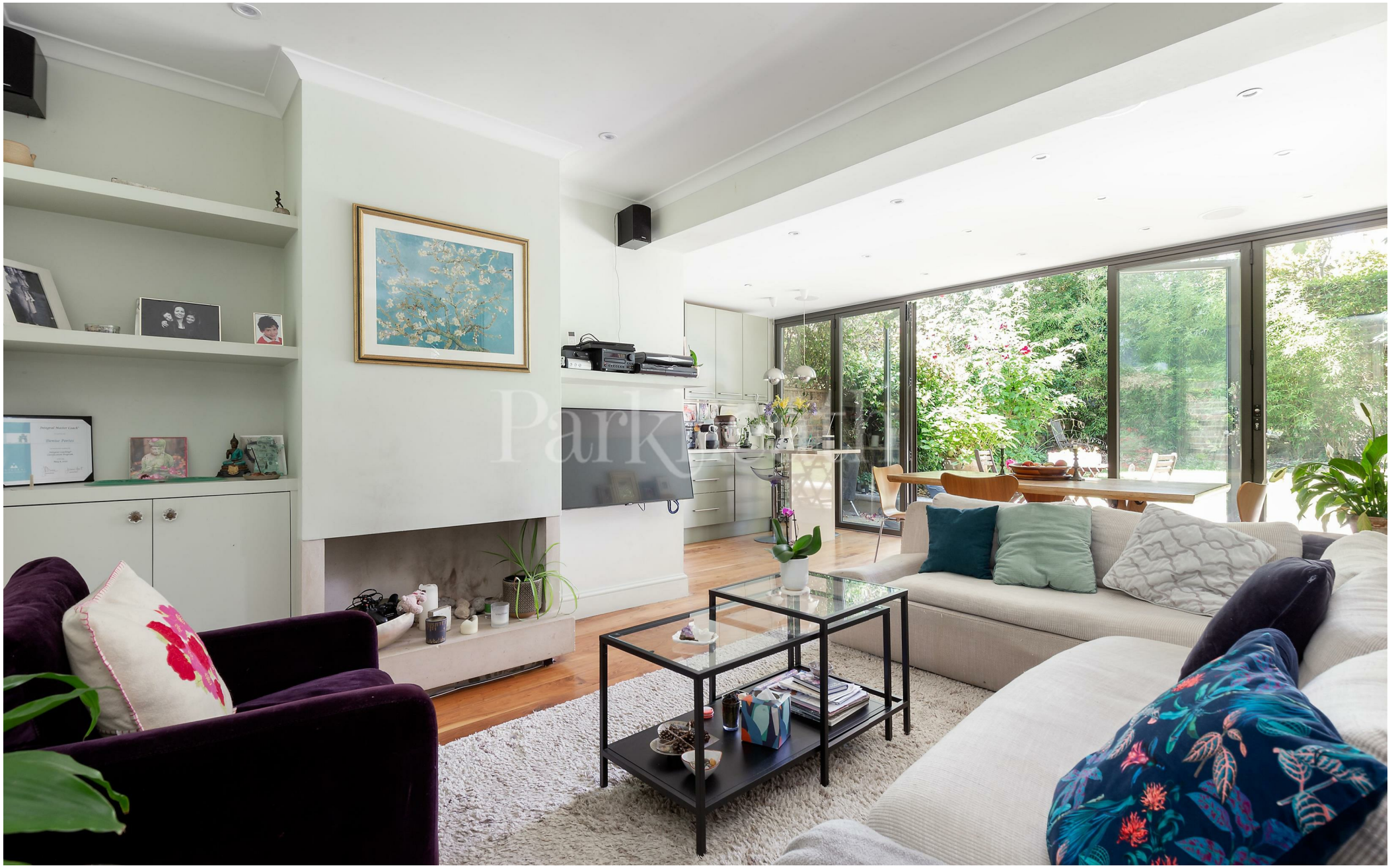
Priory Terrace NW6